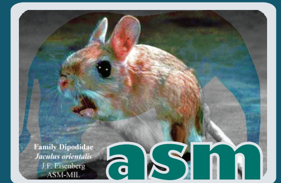
Family Dipodidae Jaculus orientalis